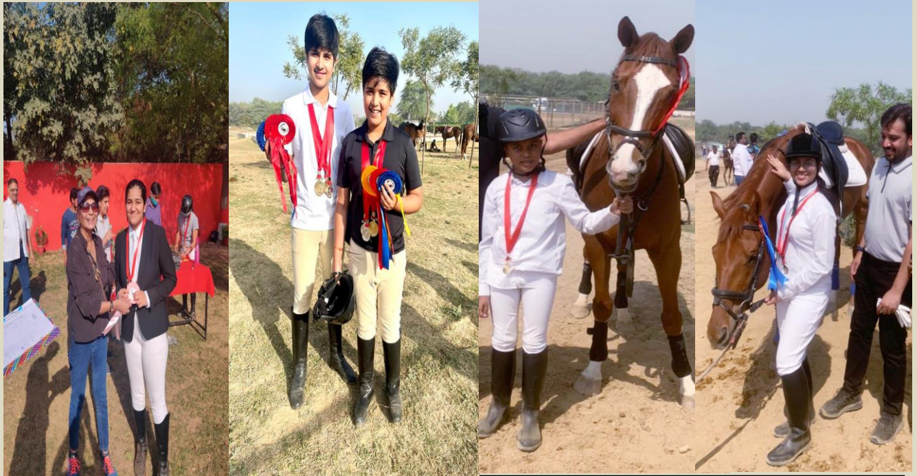
Modern School Equestrian Team at APRC Equestrian Event