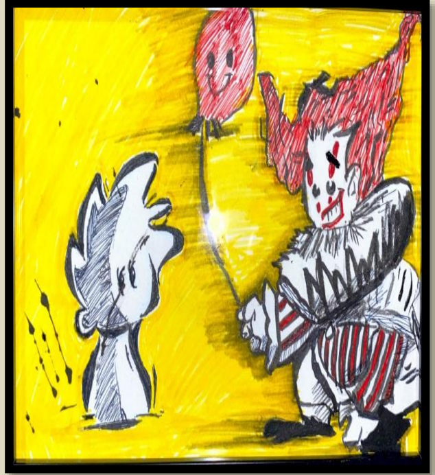
Drawing by NAVYANSH PANT (S6G)

This sketch symbolizes unity, equality and peace. The Eye represents our mindset and our way to see life and its beauty. The Eye is still seeking the world with peace and divine love for all.