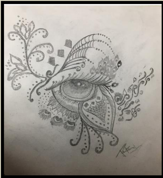
Sketch by RAGHAV SWAROOP (S6G)

This sketch symbolizes unity, equality and peace. The Eye represents our mindset and our way to see life and its beauty. The Eye is still seeking the world with peace and divine love for all.