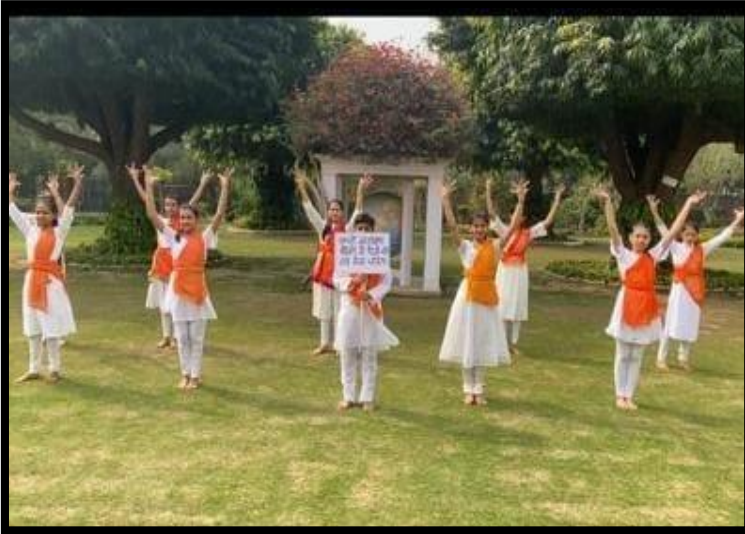
Image of Modern School students performing during the event