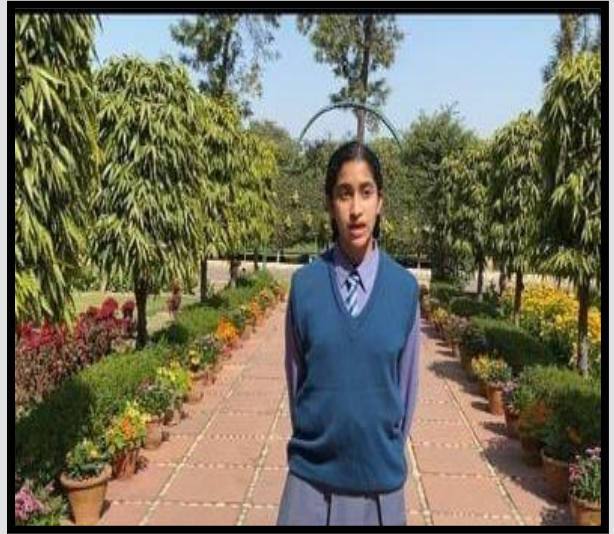
Modern School student reciting a poem