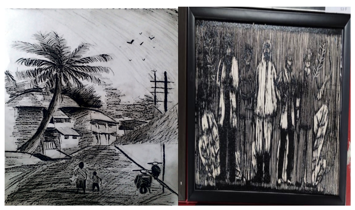
By: Anshneh Jindal(S2F)