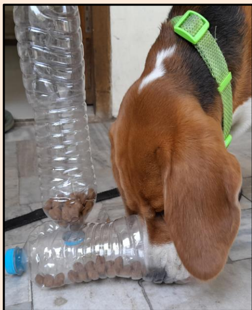
Animal Feeder by Vrinda Bhasin S5A

Students of Modern School, Barakhamba Road, have shown their creativity by reusing the single use plastic bottles and making upcycled items like an animal feeder, planter and bird water feeder.