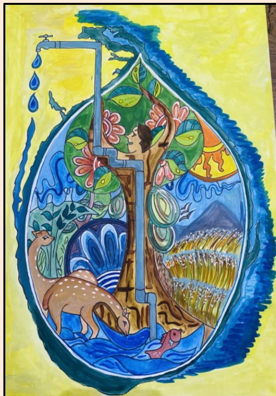
Painting by Artham Aggarwal S2G