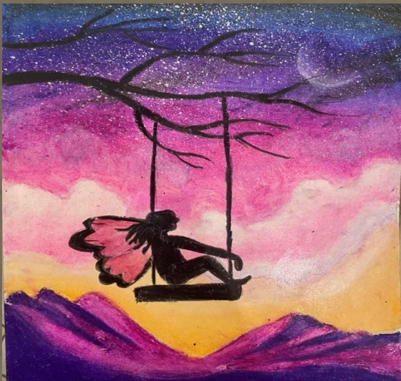
HARSHAL KAPOOR, S2G