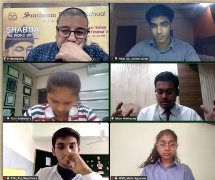
Screenshot from the virtual event