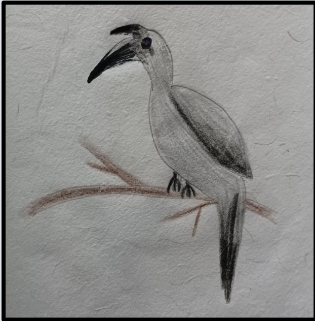
Ria Krishnaan, S1H

Creative thinking is like a garden with myriad thoughts, where the seed of creativity is planted deep. The students of Modern School, Barakhamba Road, know well how to water the plants of creation, hence, managed to grow trees during the summer break not losing any opportunity to showcase their impressive talents using colour palettes of their dreams, harnessing their artistic skills.