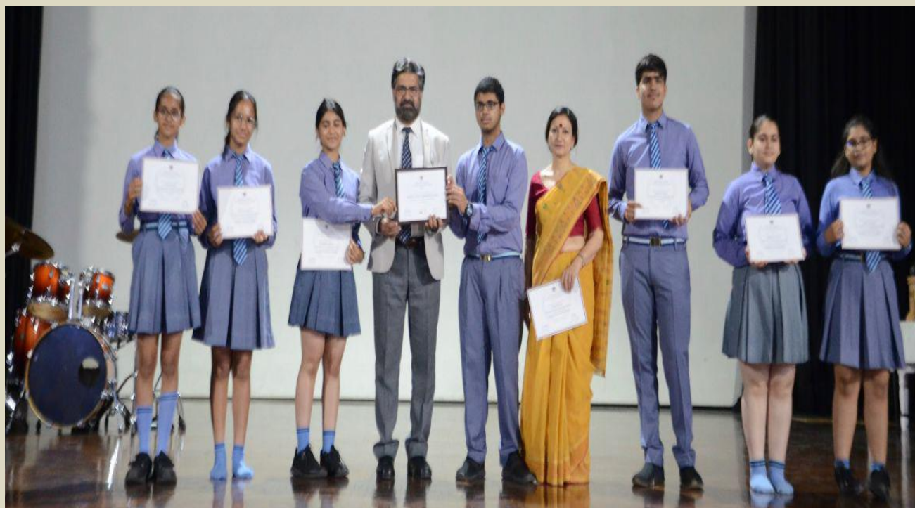
Modern School MUN Winners

MODERN SCHOOL BARAKHAMBA ROAD www.modernschool.net Est. in 1920