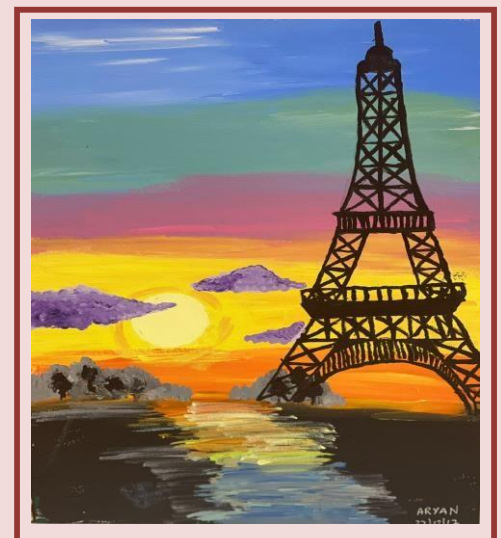
ARYAN GUPTA - S1 D

“A canvas is an extremely durable plain woven fabric where an oil painting can be done. It is often used to make sails, backpacks, shelters, handbags, electronic device cases and shoes. It is typically stretched across a woven frame.”