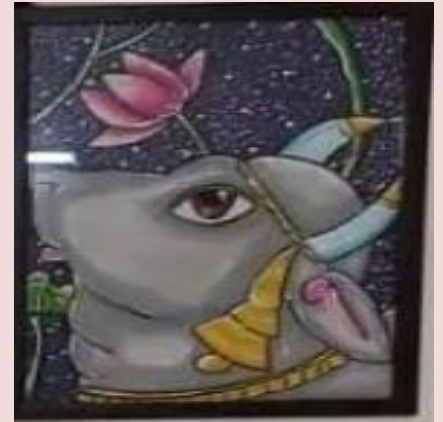
MYRA AGGARWAL – S3 B

“Creativity is a natural extension of our enthusiasm”