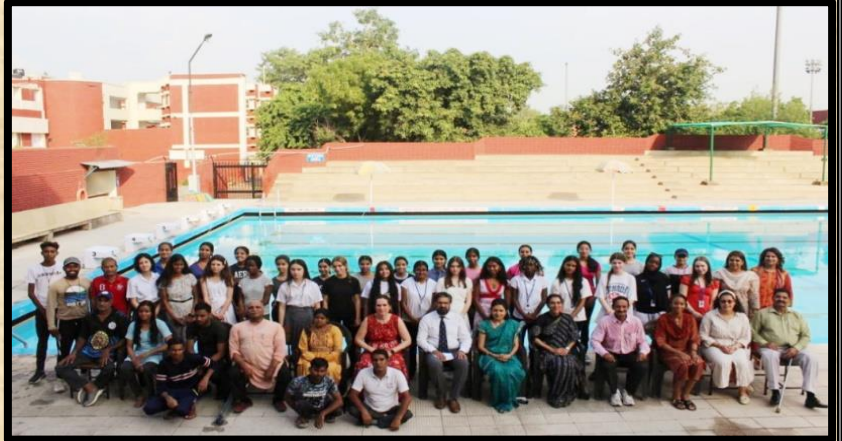
The delegation gathers for a group photograph near the swimming pool area

To allow for a realistic experience of the Indian culture, the delegation toured heritage sites all throughout the National Capital on 12 th July, 2022. Furthermore, the students were exposed to the magic of paper and colours in the Paper technology and Painting departments. After a creative session, the students took part in swimming and horse-riding activities before heading out for a