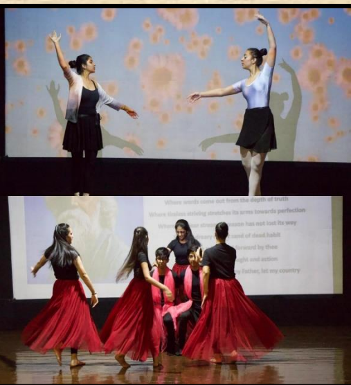
Glimpses of the cultural performance

United Kingdom and Modern School, Barakhamba Road. Becoming a platform to share cultures and traditions, the exchange programme allowed the students to look through the eyes of one another and understand what the world is like for them. After a long journey, the delegation was informally welcomed by the students and the host families on the first day, where they exchanged tokens of appreciation to display their willingness to open their homes for hosting the Townley delegates.