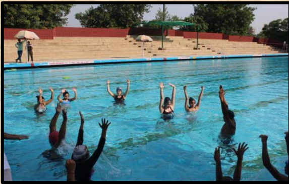
Students participating in the swimming activity

memorable evening of high tea. 'Sportability' , a new initiative by Modern School, Barakhamba Road, is a sports venture for specially abled children. The delegation, along with their hosts, interacted with the members of the Sportability team through the swimming pool activities. Later in the evening, a student of Modern School and her parents hosted a fantabulous arrangement of catering, music, and games. The teachers, as well as the students from both the schools, were welcomed with the traditional tika and flower bracelets.