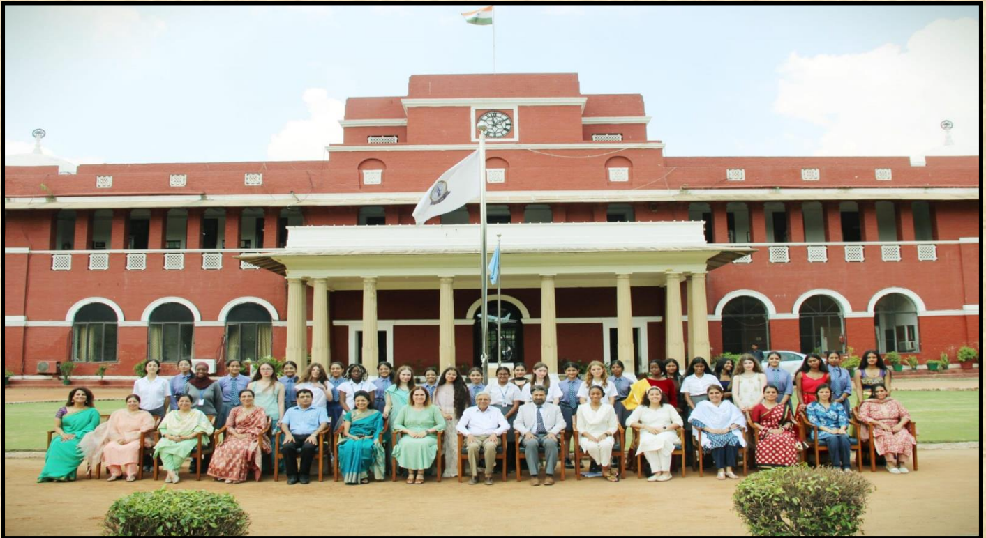
The Delegation gathers for a group-photograph