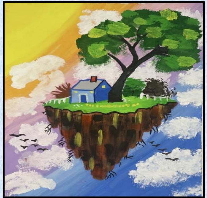
Vaanya Bothra, S1H