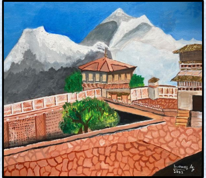
Ananmay Agarwal, S1H