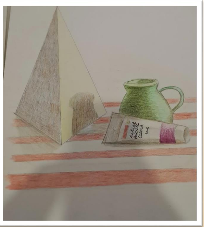
Nandini Singla S6I