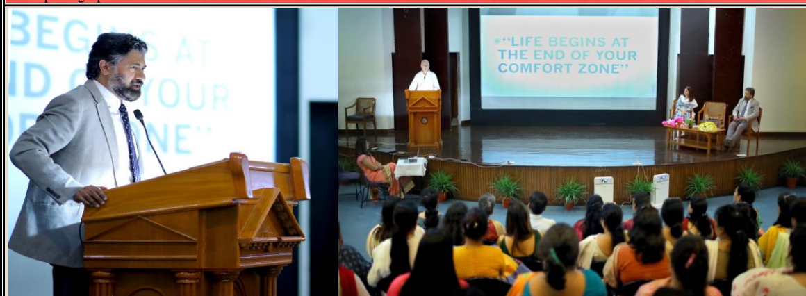
Glimpses from the staff orientation at HLL Hall