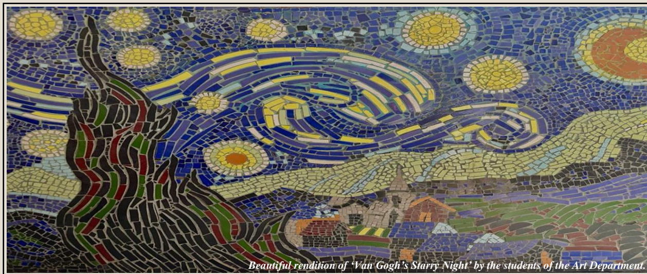
Beautiful rendition of 'Van Gogh's Starry Night' by the students of the Art Department.

In conclusion, the entire event was a resounding success and saw the eager participation of nearly 50 students from the new S6. We believe that these recruits will bring many accolades to the Debating Society.