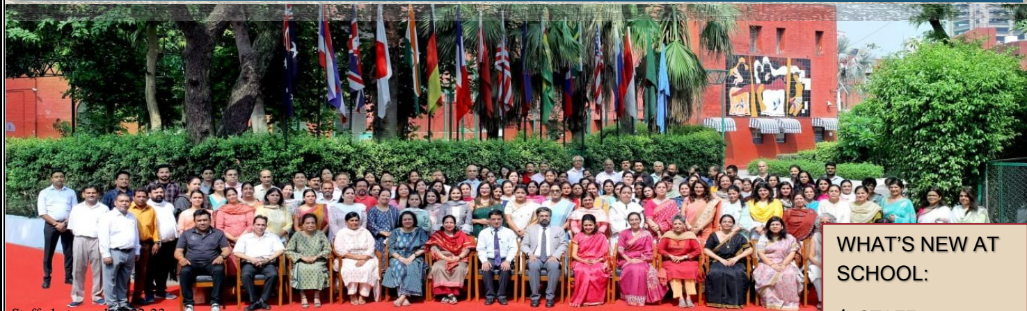
Staff photograph 2022-23