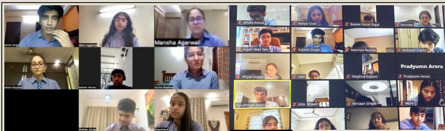
Glimpses of students from the debating society enrolment and training session.

The Debating Society of Modern School, Barakhamba Road, carried out the Enrollment and Training for students of class S6 on 24 th June 2022.