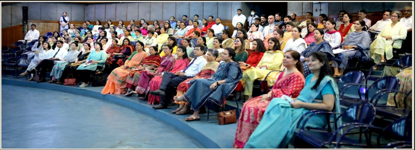
Glimpses from the staff orientation at HLL Hall

The next segment of the interaction talked about the components of effective teaching which would entail, the introduction of interactive panels; appreciation of scientific attitude and inducing curiosity among learners; conduct of remedial classes; provision of individual attention to each learner, and planning resource materials well in advance. The recent developments concerning the infrastructure facilities of the school like upgradation of furniture, renovation of the washrooms, and regular maintenance of the class cleanliness were also mentioned.