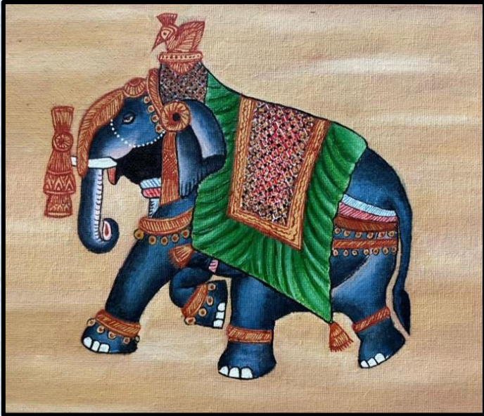
Sahensheel Bajaj, S1F

Modern School, Barakhamba Road, is not just an educational institution but also a garden with thousand budding flowers of their own kind, nurturing them every passing year with a core value system. This system allows creative young minds to come forward to showcase their artistic side. The school encourages all students to be able to express their feelings and emotions freely without any judgement criteria. This allows the children to be most expressive that exposes them to the world of vulnerability which is indispensable in the absolute growth of a child.