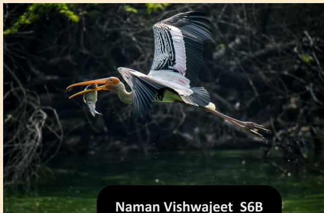
Naman Vishwajeet S6B