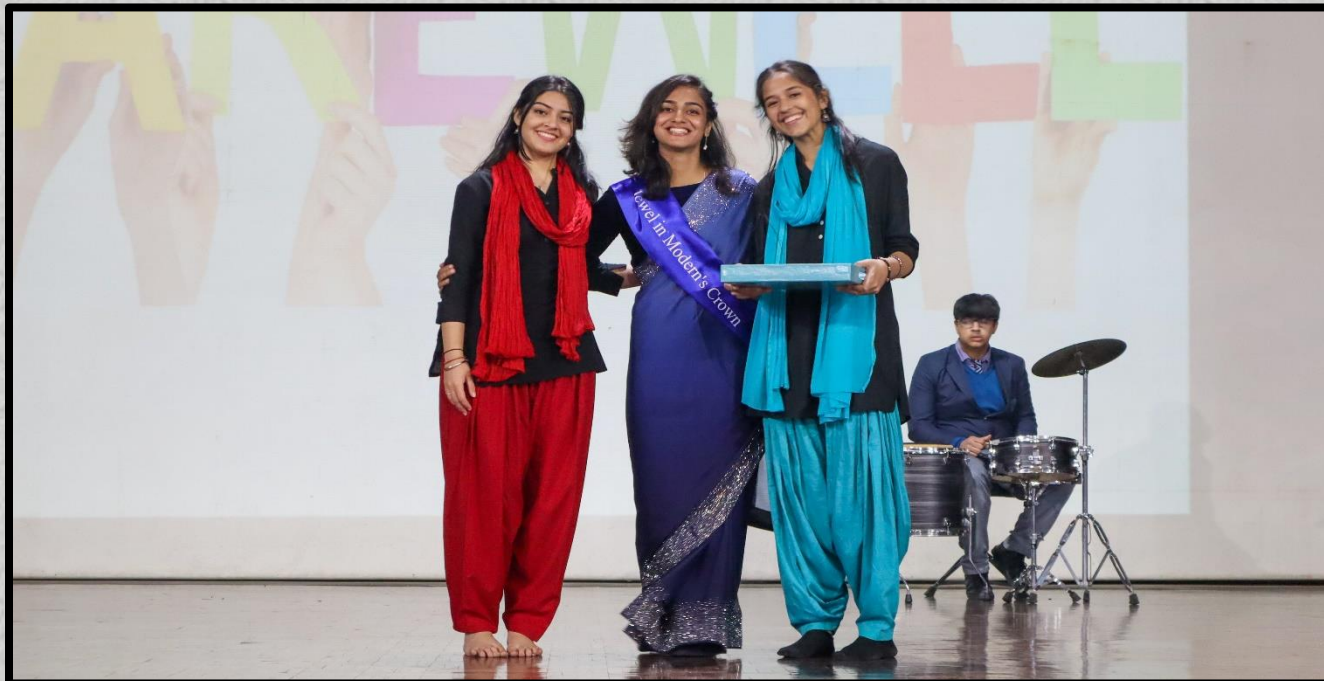
Bright and happy faces of the students during the Farewell ceremony