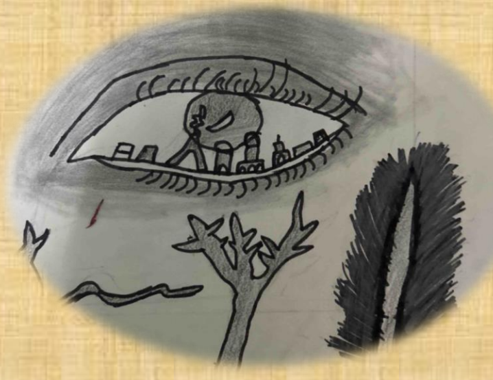
TEVIN ARORA (S2E)