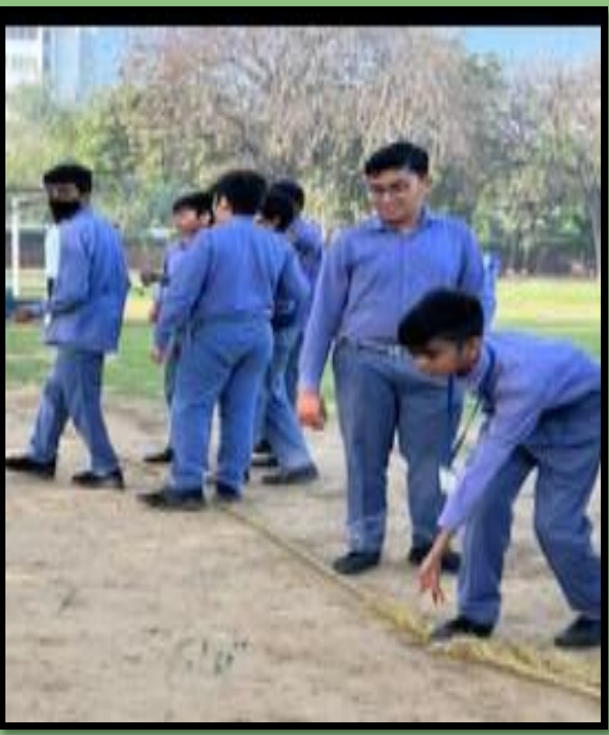
Screenshots of Enrichment Programme Activities

Modern School, Barakhamba Road recently observed 'Enrichment Programme Week' for its students from 22^{nd} - 26^{th} March 2023, wherein the children reported to school and were asked to carry the books of their interest to school, for 'Drop Everything And Read (D.E.A.R)'. It was quite impressive to watch classrooms transforming into silent library. The students participated actively in the programme as their best friends, that is, their books, rejuvenated their mind. Apart from reading, the students also cherished going to their respective SUPW Activities, which regenerated their energies especially after the stressful period of exams. Not only this but they also made the most of that one-hour where they were let out in the field to enjoy their favourite games period. It drives them to be enthusiastic, passionate and be fully associated with their sports activities, in keeping with the essence of Indian traditional games.