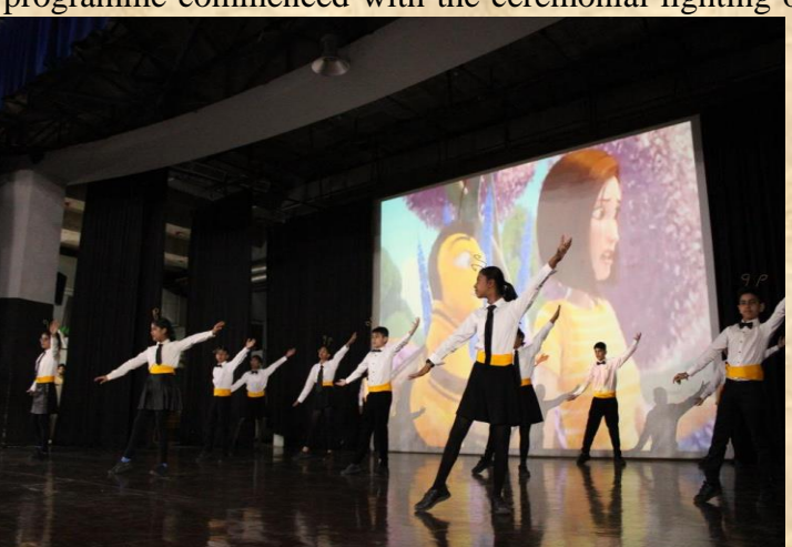
The vibrant dance performance by the students

Modern School, Barakhamba Road organised an Orientation programme for the upcoming batch of S1 on 6<sup>th</sup> April, 2023 in the Shankar Lal Hall. The said event was not only held to provide information to the students and their parents, but also give an insight into the wonderful new world they were stepping into. The programme commenced with the ceremonial lighting of lamp. To provide an