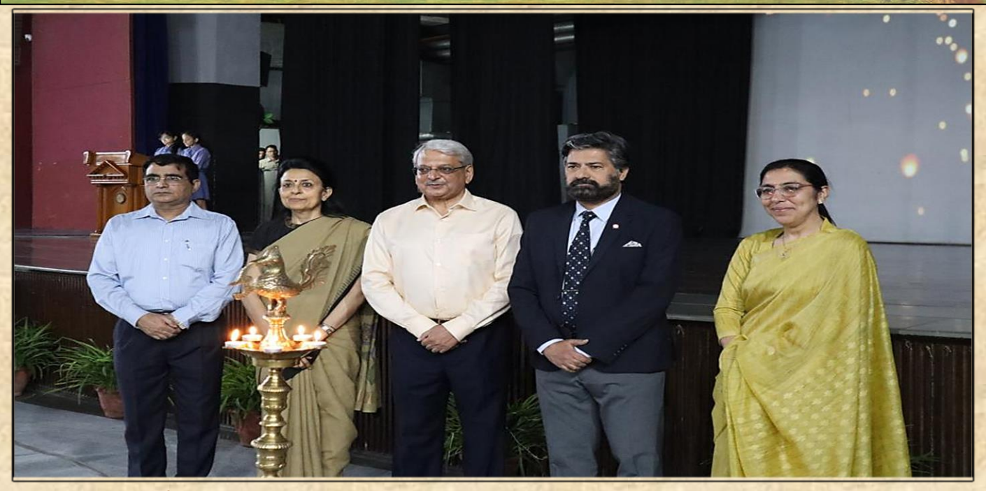
The esteemed chief guest gracing the occasion.