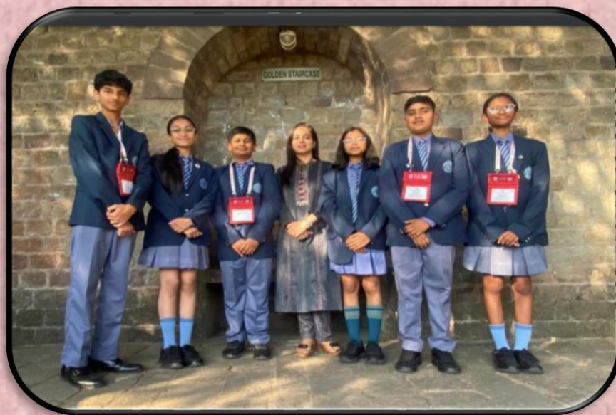
Participants of Sanawar Round Square Conference