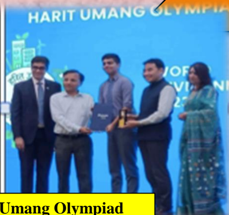
Winners Of Harit Umang Olympiad

The Harit Umang Olympiad, an year long school awareness campaign that culminated on 5 th June, 2023—World Environment Day—was organised by Panasonic India and Buddy4Study in association with the Ministry of Environment, Forest and Climate Change, Digital India and Bureau of