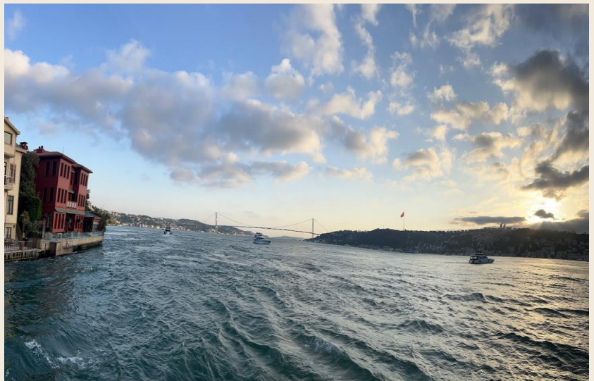
Picturesque snapshots of Turkey by Aarnav Gupta (IX-E)