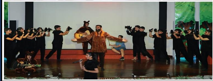
Snippets from the captivating English Musical 'Snow White'