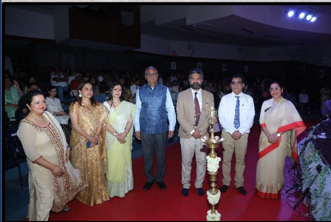
Chief guest along with the Principal and the House Masters