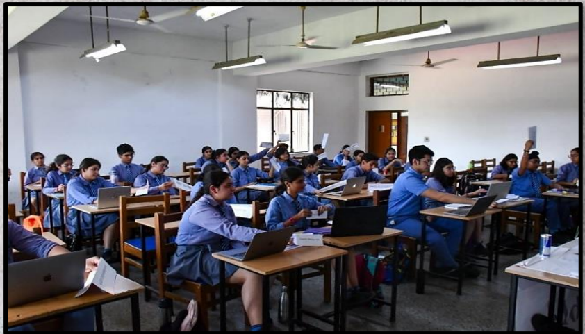
Lok Sabha Committee in Action during Public Session