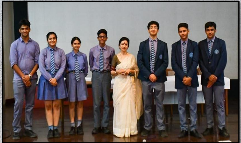
Executive Board and Awardees for the United Nations Historic Security Council