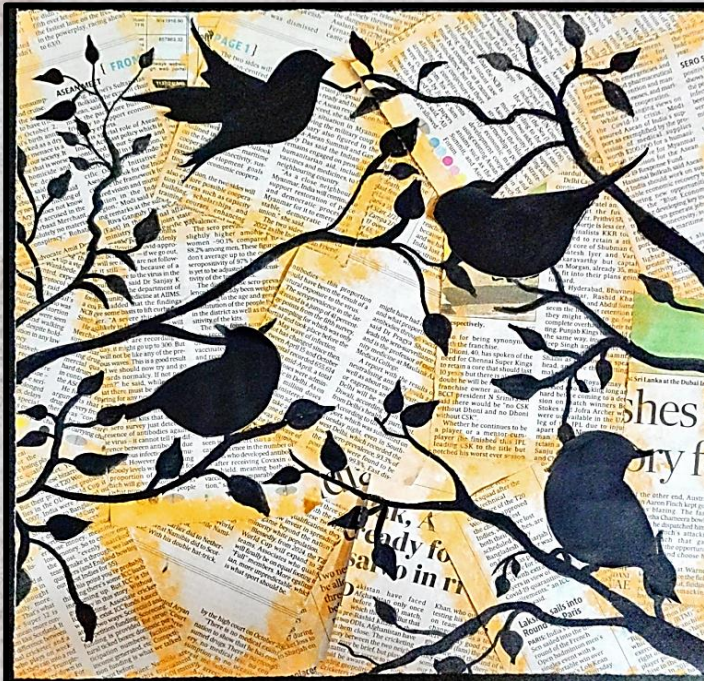
OJAS KHANDELWAL, 7C