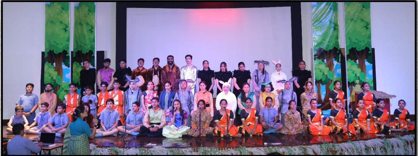
Nehru House students proudly singing their House Song