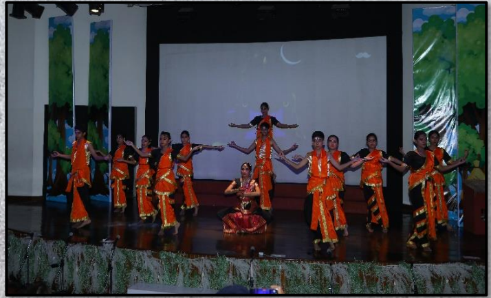
Nehru House students giving a mesmerising dance performance.

Shiva. The main highlight of the event was the captivating in-house production 'SNOW WHITE' which was an English Musical. The timeless classic transported everyone into a world where beauty, bravery and the power of true friendship and love prevailed, in the face of evil. Finally, the show ended with the students proudly singing their house song ' Shoulder to Shoulder, marching forward ', which inspired everyone to achieve peace, love and harmony. The