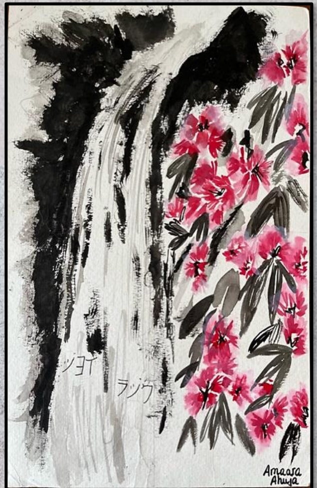
AMAARA AHUJA, 10A