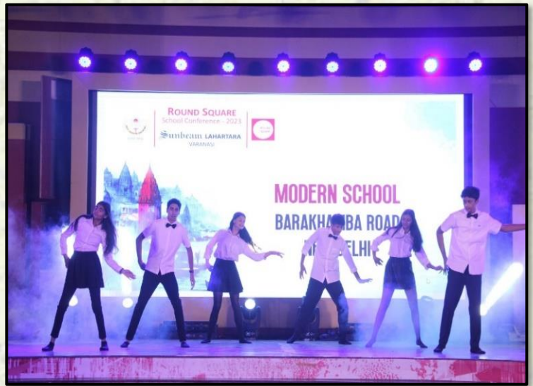
Students of Modern School proudly giving a dance performance

Special interest groups within the Round Square presented their learnings in art, theatre, and movie-making over a period of two days. The conference concluded with mesmerizing cultural performances by the participating schools and a formal vote of thanks. Overall, the students from Modern School, Barakhamba Road had a remarkable and enriching experience that will inspire them to dream big, believe in their potential, and tirelessly strive to achieve their goals.