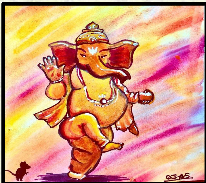
OJAS KHANDELWAL, VII-B