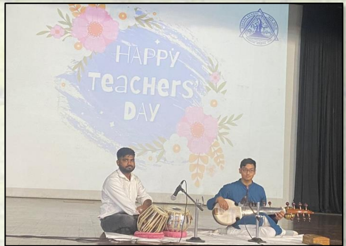
A melodious musical performance by a student.