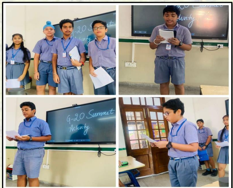
Enthusiastic students participating in the G20 Sherpa Track Activity

The G20 Summit typically involves discussions, presentations, and negotiations in various languages. Member States have the opportunity to express their views in their native languages during plenary sessions, bilateral meetings and press conferences. Aligning with the same theme, the G20 Sherpa Track Activity for the month of August was conducted for classes VI to VIII. Students presented their speech on the theme of G20 2023 through different languages of the Member States like Hindi, Spanish, French, German etc. The G20 theme played a significant role in shaping the discussions, decisions and outcomes of the event. The multilingual nature of the summit reflected the linguistic diversity of the Member States and underlined the importance of effective communication in addressing global changes. It was indeed an engaging and learning experience for the students.