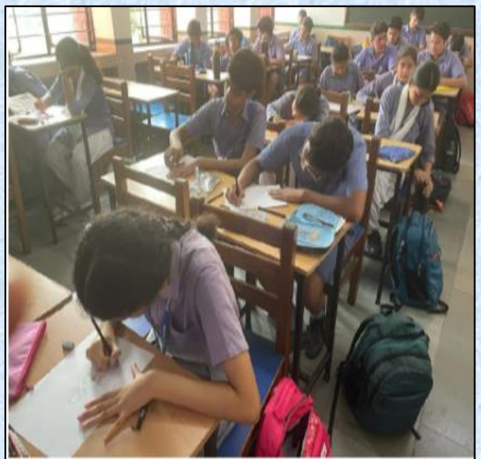
A still from the event

On 21 st July, 2023, the Tobacco Sensitization Committee of Modern School organised a Poster Making Competition for students of Classes IX and X, during the Class Teacher's Period. The activity was intended towards sensitising the students about harmful effects of consuming tobacco. The topic for the poster was 'Negative impact of Tobacco Use'. The students enthusiastically designed their posters with innovative ideas of presentation. Twenty five students who did exemplary work were awarded the Good Chits.