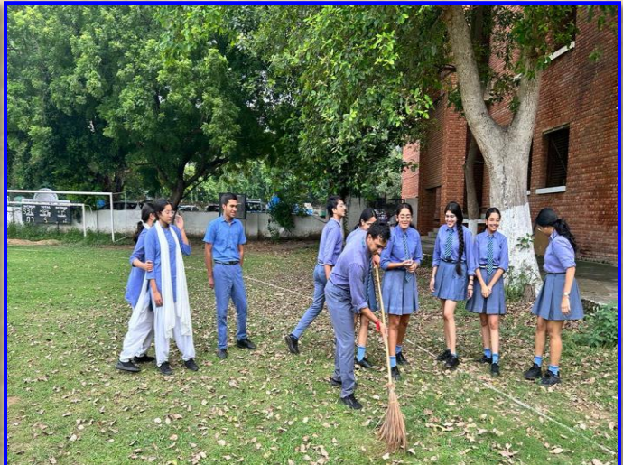
Members of Interact Club during Padyatra and Safai Abhiyan