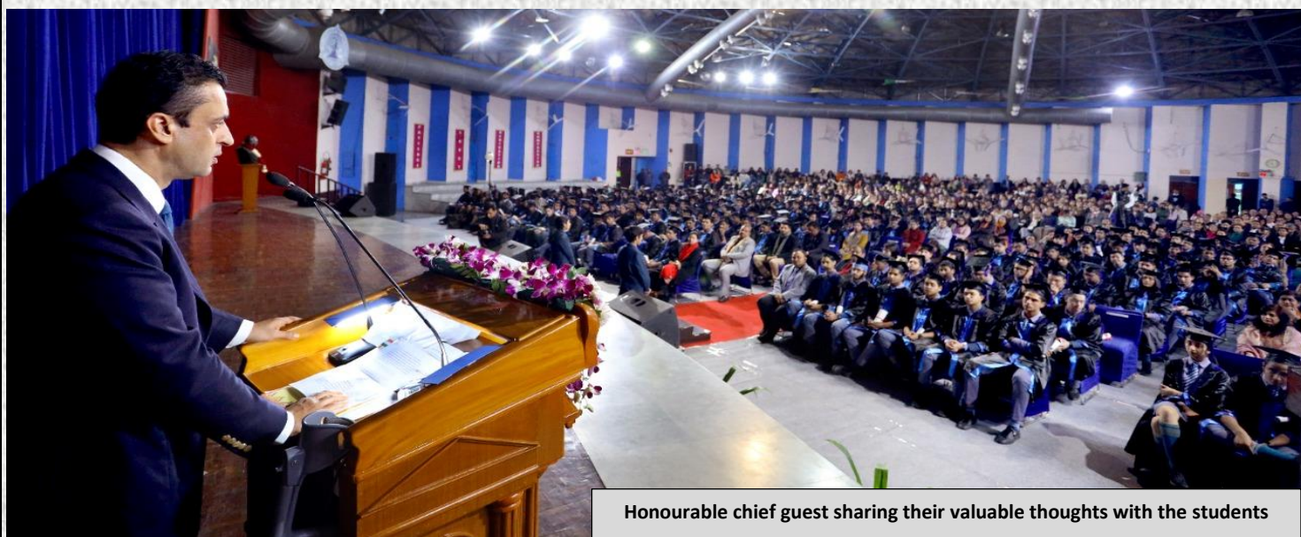
Honourable chief guest sharing their valuable thoughts with the students