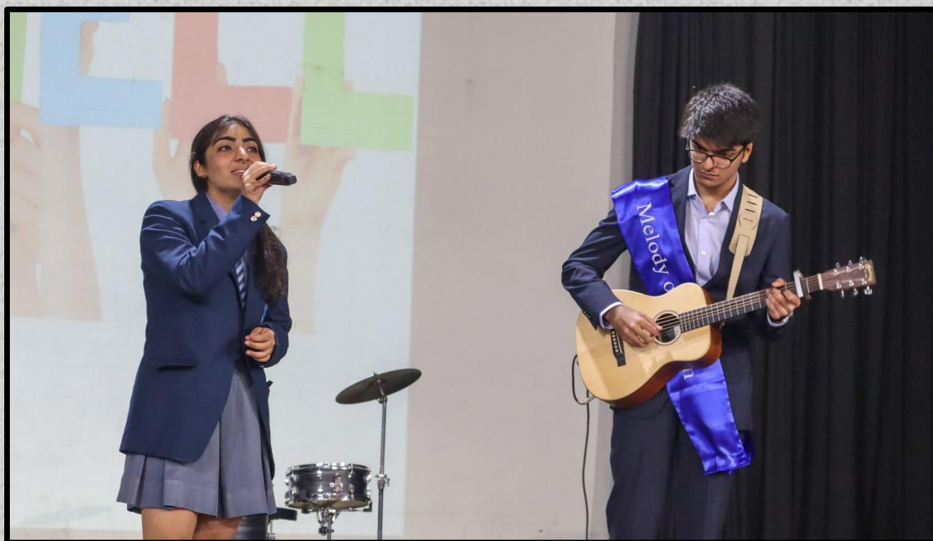
A melodious musical performance by the students