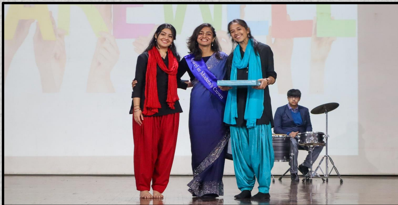
Bright and happy faces of the students during the Farewell ceremony