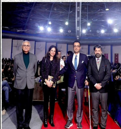
Prestigious guests gracing the Farewell ceremony

The long-awaited day had finally arrived when the class of 2023 graduated from