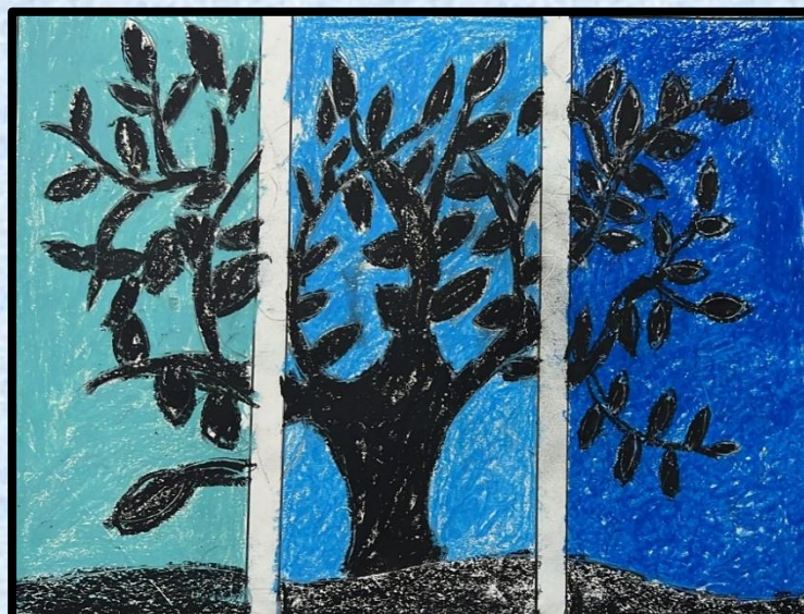
PRAKHYA GOEL, S2F