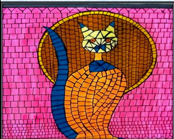
OMYRA KATHPALIA, S2F