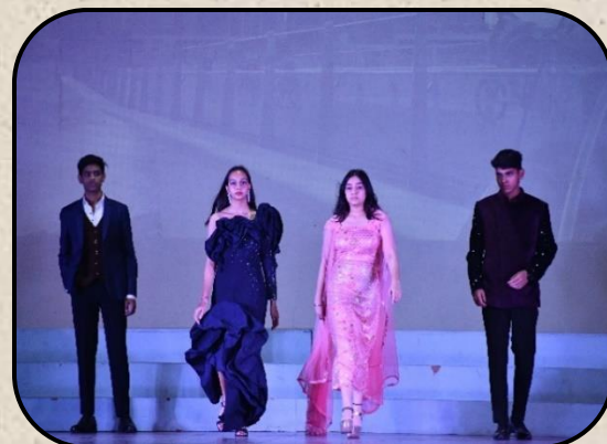
The talented students during the Fashion Show