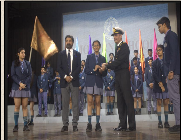
Students being awarded with badges by our esteemed Guest.