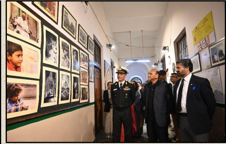
Honourable Chief Guest looking and appreciating the creative artworks of the students.