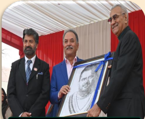
The School Memento being presented.