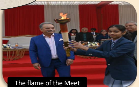
The flame of the Meet