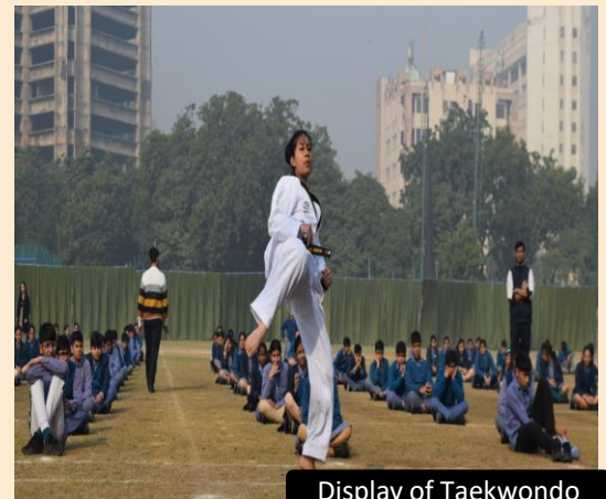
Display of Taekwondo

spirit of the games, was executed by six distinguished national and international sportspersons. The grand Horse Show, a spectacle of equestrian brilliance, showcased the harmonious movement of horses in sync with music, creating a mesmerising dance that echoed the timeless connection between humans and these majestic creatures. The Gymnastics Jamboree and Yoga display held the audience in awe, showcasing the exceptional talents of students from classes six and eight. The Taekwondo Drill, presented by eighth-grade students, demonstrated a series of techniques with each moment reflecting dedication and skill. Furthermore, the students of class seven exhibited their prowess in various sports, including basketball, football, and prominently cricket, offering a thrilling display of sports talent. Their passion extended beyond sports, as they embraced their love for dancing to the rhythm of the song "Waka, Waka." The entire event was a celebration of skill, dedication, and the joyous spirit of sportsmanship. The exhilarating races showcased the athleticism and competitive spirit of our budding athletes. From the swift sprints to the thrilling relays, each race was a testament to their dedication and passion for sports as they competed for the honour of their house and the glory of sports. The atmosphere was charged with competitiveness as each athlete was pushing themselves beyond their limits,