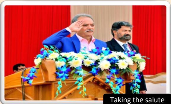
Taking the salute