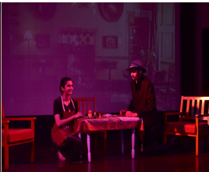
Captivating performances by the Ashoka House Students