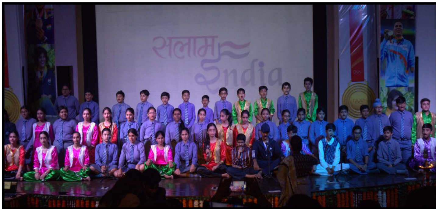
Unwavering spirit of the Kalam House students

dancers of the House then exhibited their talent with a captivating performance of Kathak and truly celebrated the rich cultural tapestry of Indian heritage with their performance. Keeping in mind the spirit of the Modern School Venture ' Sportability ', the members of the house presented a musical Ballet named ' Jazbaa '. The ballet was followed by an English play ' The Landlady ' based on 'The Art of Taxidermy' performed by the versatile actors of Kalam House. The performances of the evening culminated with the ' House Song Salaam India ', truly instilling the spirit of patriotism among the audience.