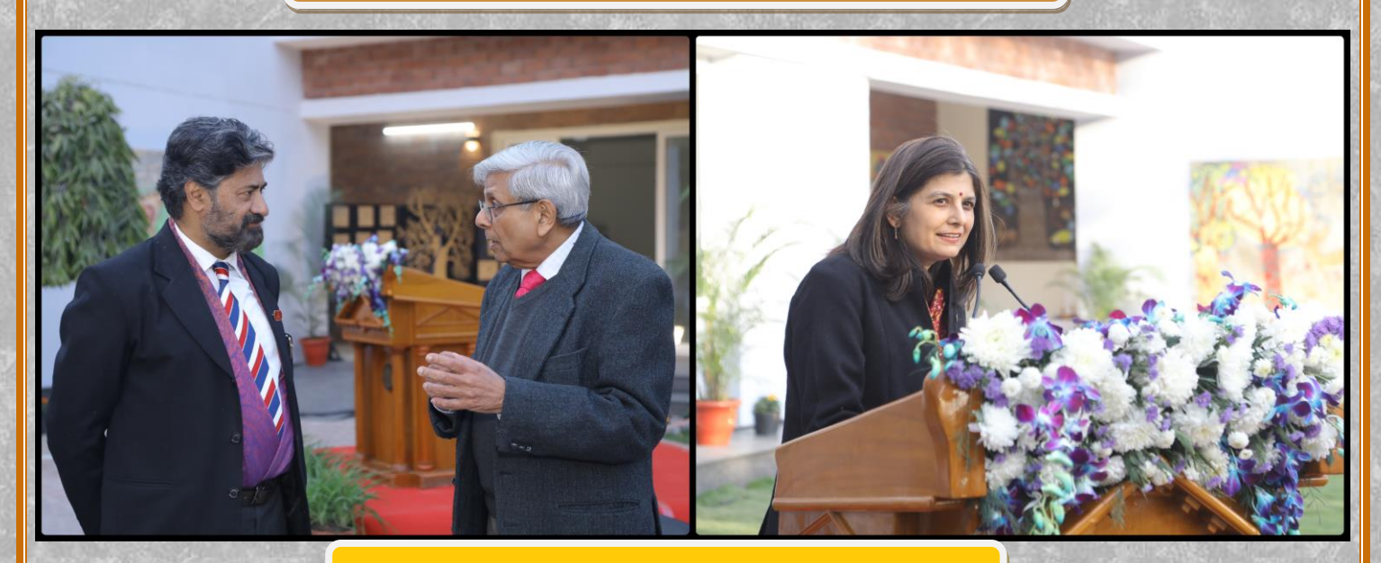
Remarkable moments during the august occasion

Modern School, Barakhamba Road, celebrated the inauguration of the Centenary Block on 12<sup>th</sup> January, 2024. The ceremony steeped in the school's century-old legacy, commenced with a powerful reminder of the institution's guiding principles— "Nyaymatma Balheenien Labhya," highlighting the importance of resilience in the pursuit of self-realization. The grand occasion marked the dedication of the recently inaugurated structure as a girls' hostel, signifying a dedication to equal education. It will serve as the home for the MIE-Modern Institute of Education, embodying the belief that knowledge flourishes through dissemination. This progressive step aligns with Modern School's dedication to fostering an inclusive and supportive learning environment for all students.