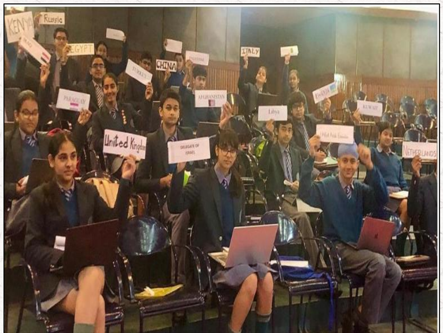
Participants during the Intra Mock MUN

It was an enriching experience for the students and it enabled them to reflect upon the current issues and express themselves effectively.