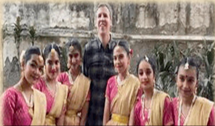
Modern school students with the renowned author Jeff Kinney

Modern School, Barakhamba Road, consistently prioritizes, providing enriching learning experiences for young minds, especially through encounters with esteemed authors, fostering a passion for reading and writing. This commitment was evident during the HT Pace Literature and Culture Fest, 2023 held on 14 th December, 2023 at the LTG Auditorium, New Delhi , featuring the 'Gregsapace' event with the celebrated author of 'Diary of a Wimpy Kid,' Jeff Kinney . Students of Modern School extended a warm welcome to Jeff Kinney during the inaugural ceremony. The event marked the launch of the highly anticipated eighteenth book, 'No Brainer' , from the iconic 'Diary of a Wimpy Kid' series.