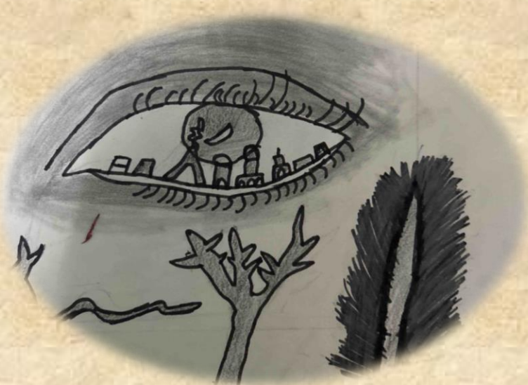
TEVIN ARORA (S2E)