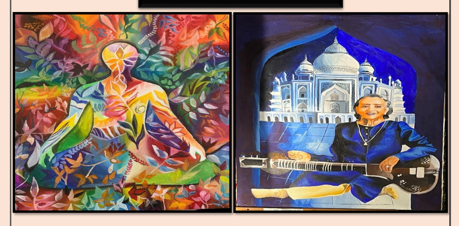
SOME CREATIVE ART WORK MANIFESTED BY IRA KALRA IX D