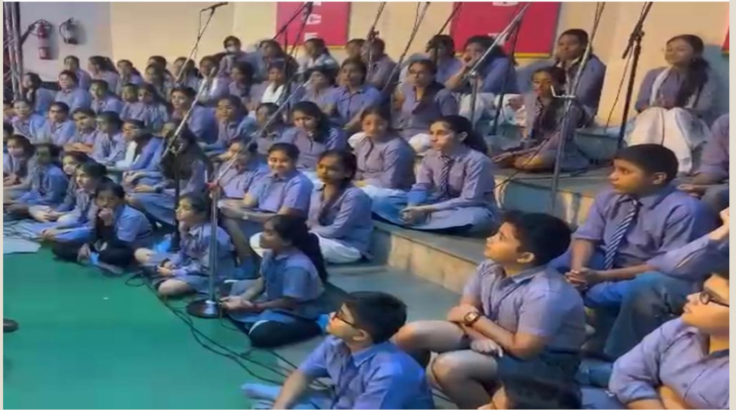
Choir and Ballet students practicing.

The ballet was a massive undertaking, involving students from class VI to XII, with practices beginning a month prior to the event. The experience was both educational and entertaining, as the students delved into the beauty of music and learned to appreciate the eras gone by. In total, 220 students of Ballet and students of choir came together to create a magical and memorable dance performance, leaving the audience in awe of their talent and dedication. It was a truly magnificent and unforgettable time for everyone involved, and the school's tradition of excellence in the arts was upheld with pride and grace.