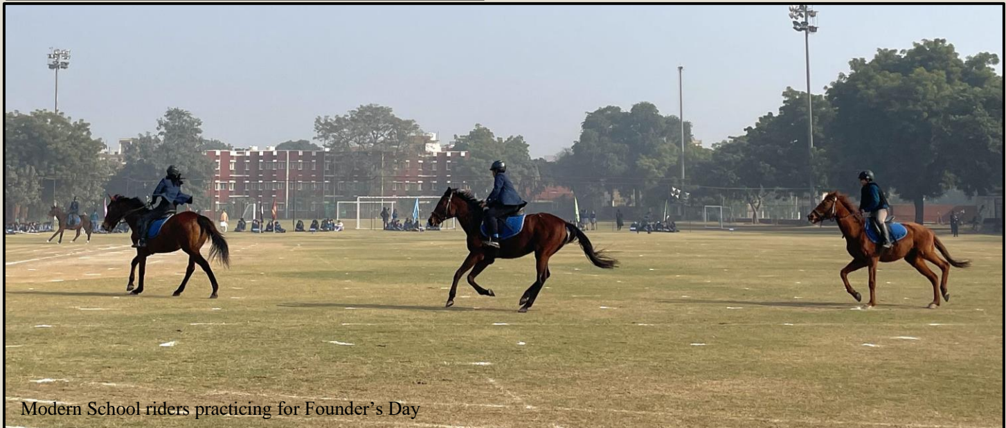
Modern School riders practicing for Founder's Day