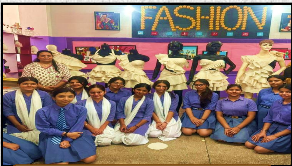
Enlivened participants with their prepared samples

The Fashion Technology Department organised a workshop on 27 th April, 2024, for the students of classes XI and XII. The participants acquired the opportunity to learn about the techniques of fabric draping on a dress form to create garment prototypes under the meticulous assistance of the professionals from Pearl Academy of Fashion, Delhi . The mentors guided the participants at every step. The workshop helped the students to acquire knowledge about types of patterns making, basics of draping and advanced draping.