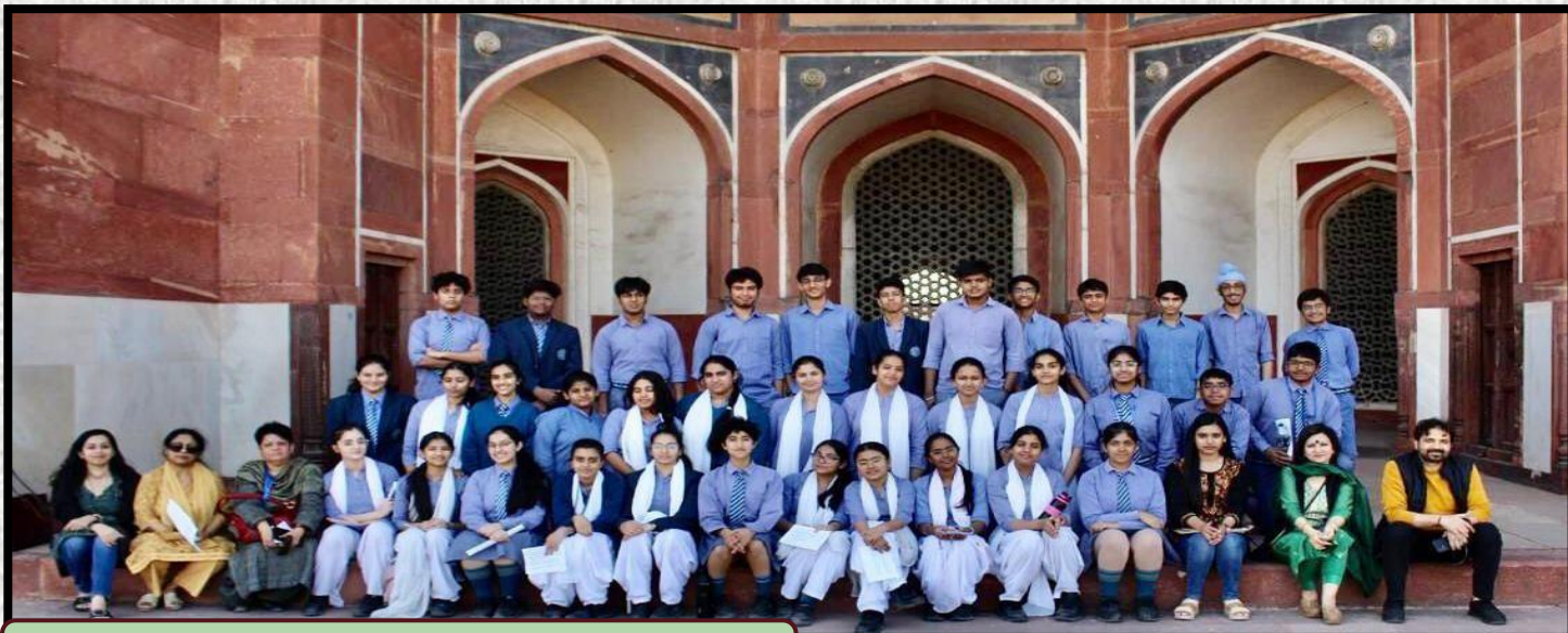
Elated students during the educational tour