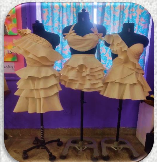
Fashion draping samples

During the session, the students got a chance to expand their potential and creativity set by learning new techniques and skills. The workshop was extremely fruitful for the students, as they learnt techniques which can be further used to create different looks. It fostered a collaborative learning environment and equipped attendees with tools to enhance their design capabilities in the fashion industry.