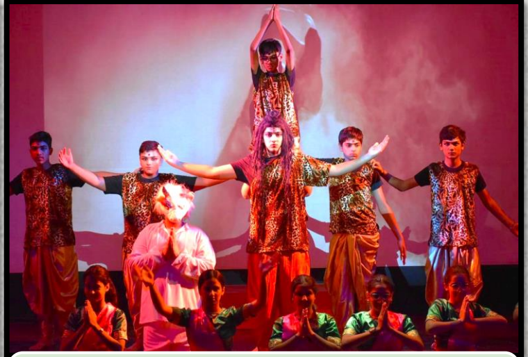
Magnificent demonstration during the ballet "Illusion versus Reality"