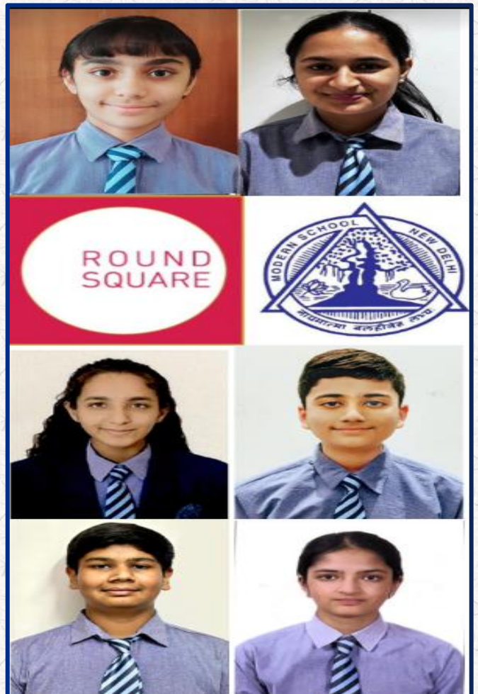
Participants during the Round Square session

In the end, all the participants resolved to work together, towards promoting unity at personal and institutional level, believing that even though humans are not united by faith, they can be united by love.