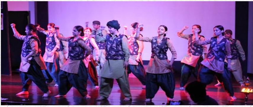
Dancers of Subhash House in action during the event