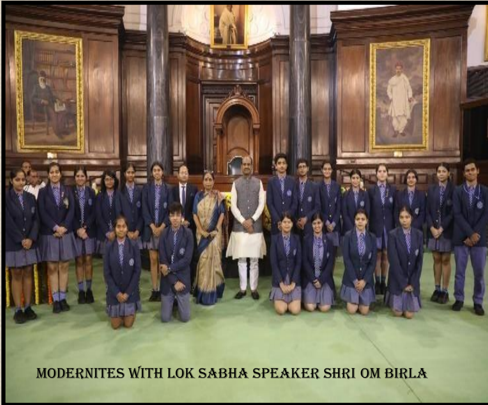
MODERNITES WITH LOK SABHA SPEAKER SHRI OM BIRLA