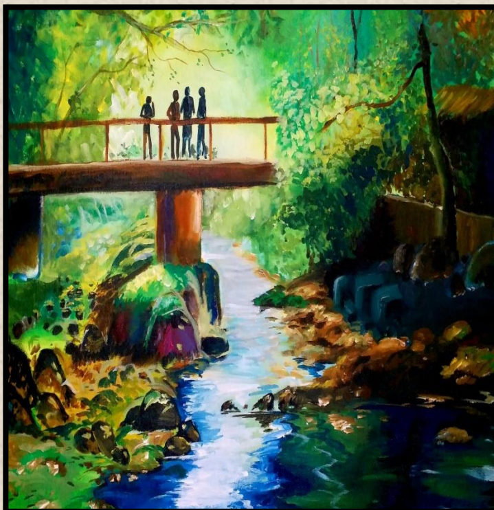
BY ANSHNEH JINDAL IX F