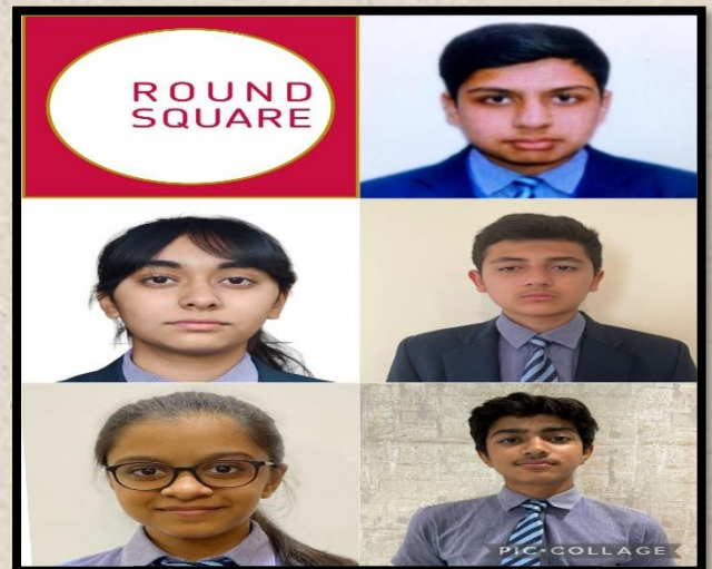
ROUND SQUARE EVENT