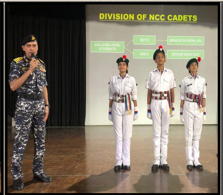
NCC CADETS DURING RANK CEREMONY

The Cadet’s name and ranks are as follows: