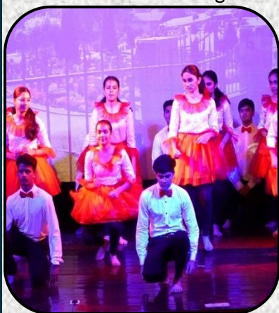
Talented students giving a captivating dance performance.