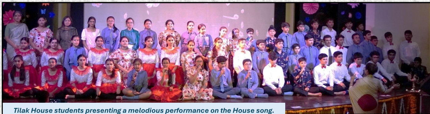
Tilak House students presenting a melodious performance on the House song.