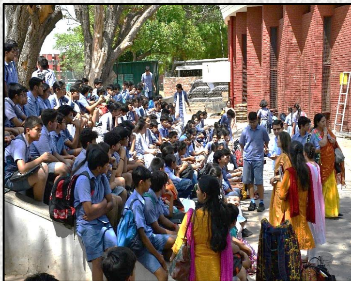
Students and Teachers assemble in the Basketball Court during the Drill.

On 2 nd May, 2024, a mock evacuation drill was organised for the students of Secondary Wing of Modern School, Barakhamba Road. A long bell rang at 1:40 p.m. to which the students and teachers responded immediately. Teachers directed the students to take the nearest staircase and assemble in the Basketball Court. The drill was completed successfully in less than two minutes. It was organised to check the readiness of the school to face any such emergency during any natural calamity and to make the staff and students aware about the rescue operation and its procedure. The evacuation drill was monitored by Dr PP Virmani (Headmaster of Secondary Wing) who addressed the students about certain necessary precautions to be taken during the time of emergency.