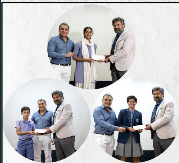
Academic and Sports scholars getting recognised.

graced the occasion with their presence. The Trust took the opportunity to recognise and celebrate the academic and sports achievements of its scholars. As parents engaged with teachers to collect their children's results, a sense of pride and accomplishment filled the air. The event resonated with the ethos of inclusive education and learning, fostering a sense of unity and celebration.