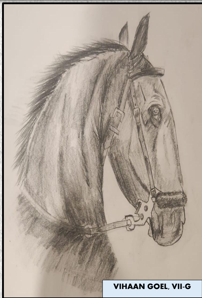
VIHAAN GOEL, VII-G