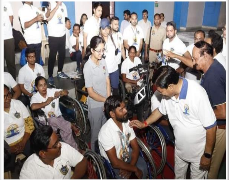
Members of Sportability celebrating Yoga Day at Shankar Lal Hall