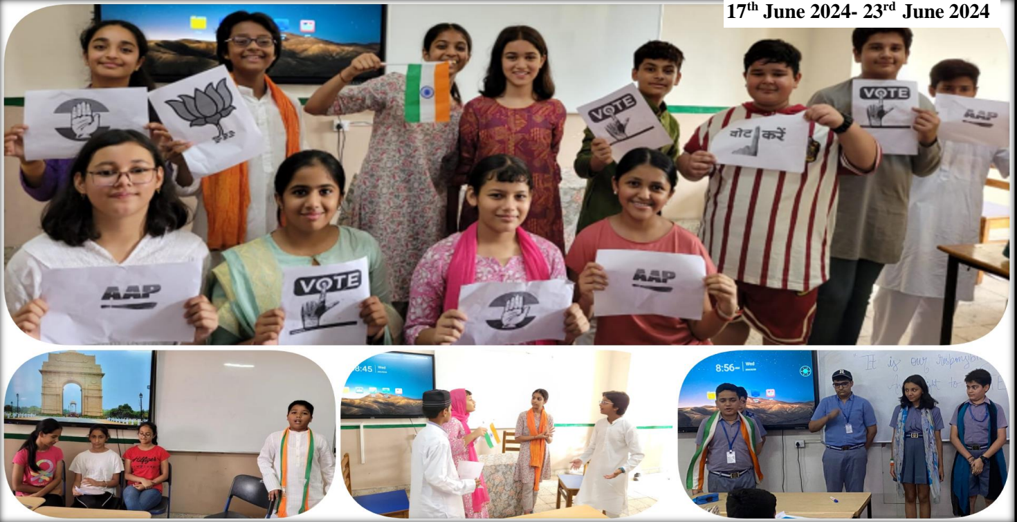
Students of Class VIII performing Role Play in the classroom