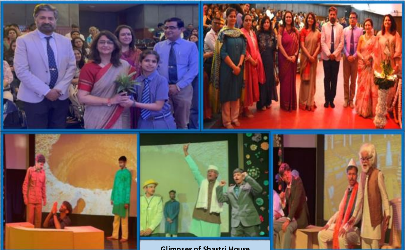
Glimpses of Shastri House