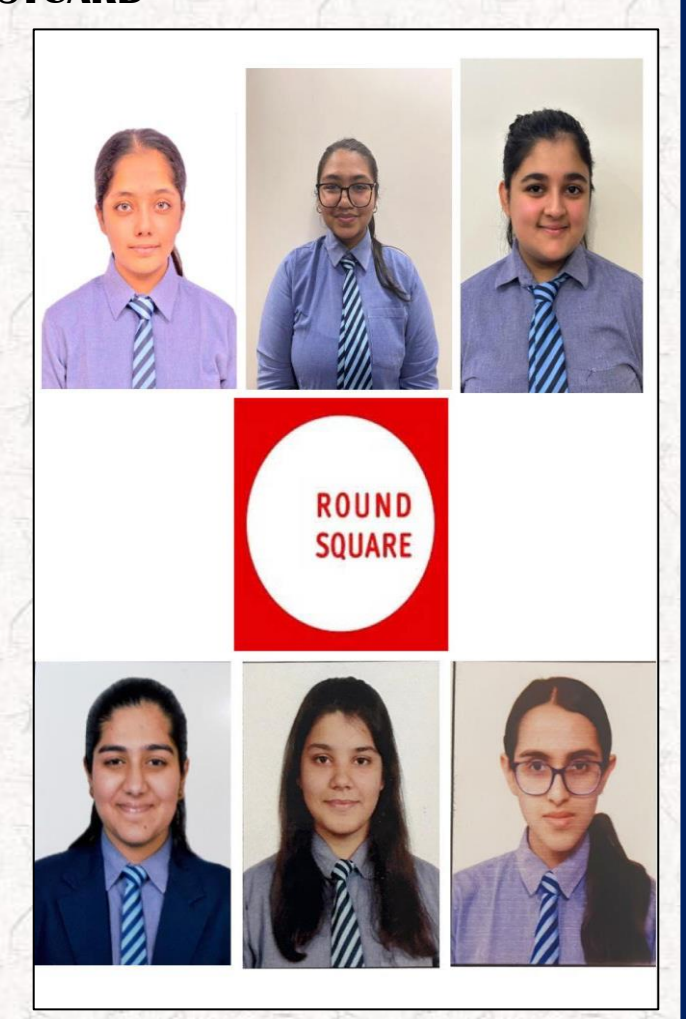
Participants during the Round Square session

The conference's theme was 'What makes life meaningful?' The Round Square Postcard Conference focused on this profound topic, starting with a presentation showcasing diverse global perspectives on the meaning of life.