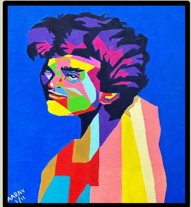
ARTWORKS BY AARAV BHATIA S7-J