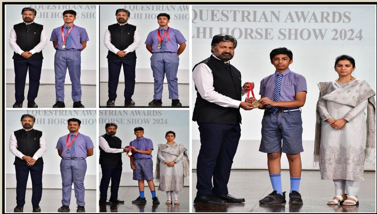
AWARDEES OF DELHI HORSE SHOW