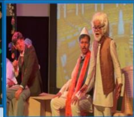
Glimpses of Shastri House