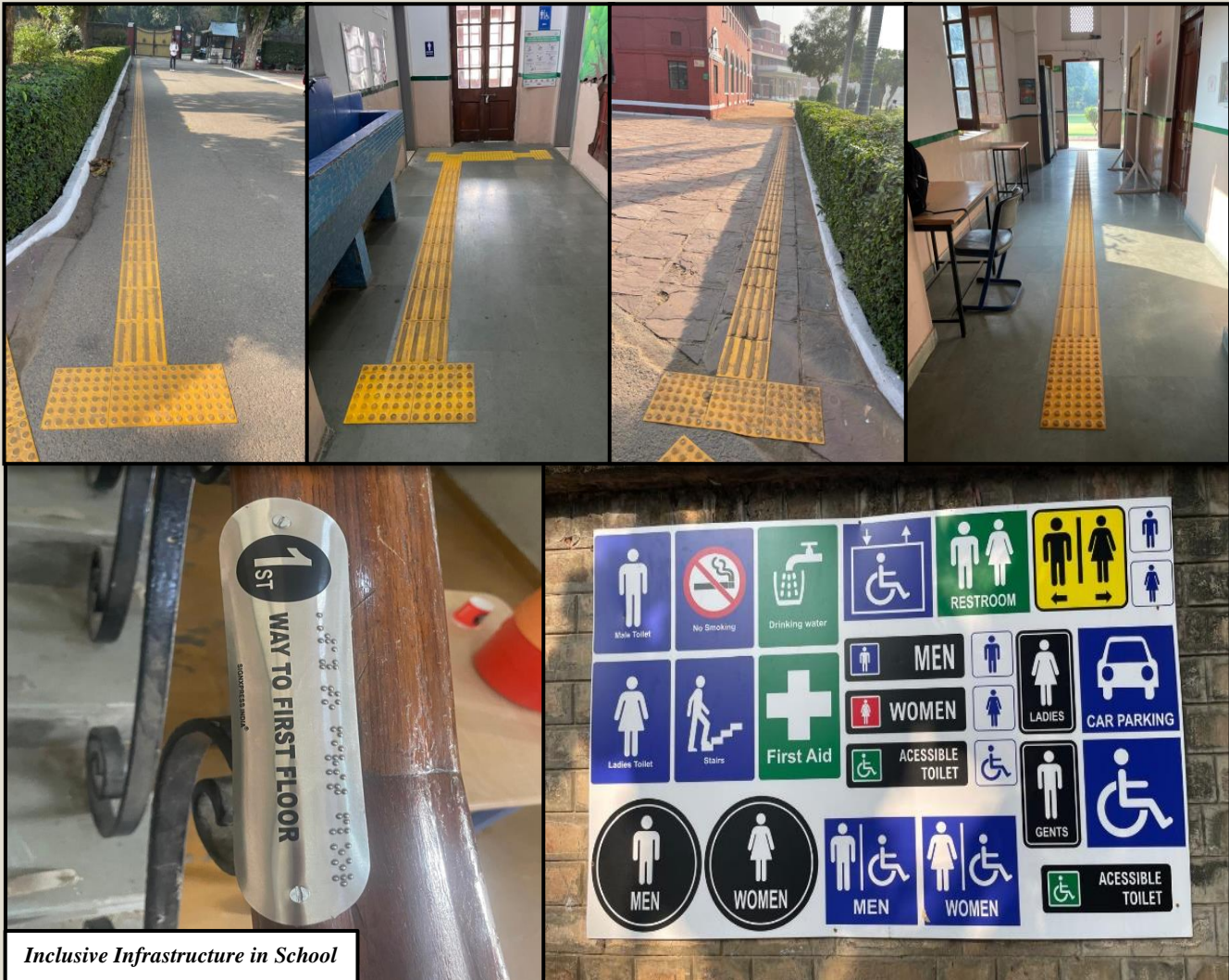
Inclusive Infrastructure in School