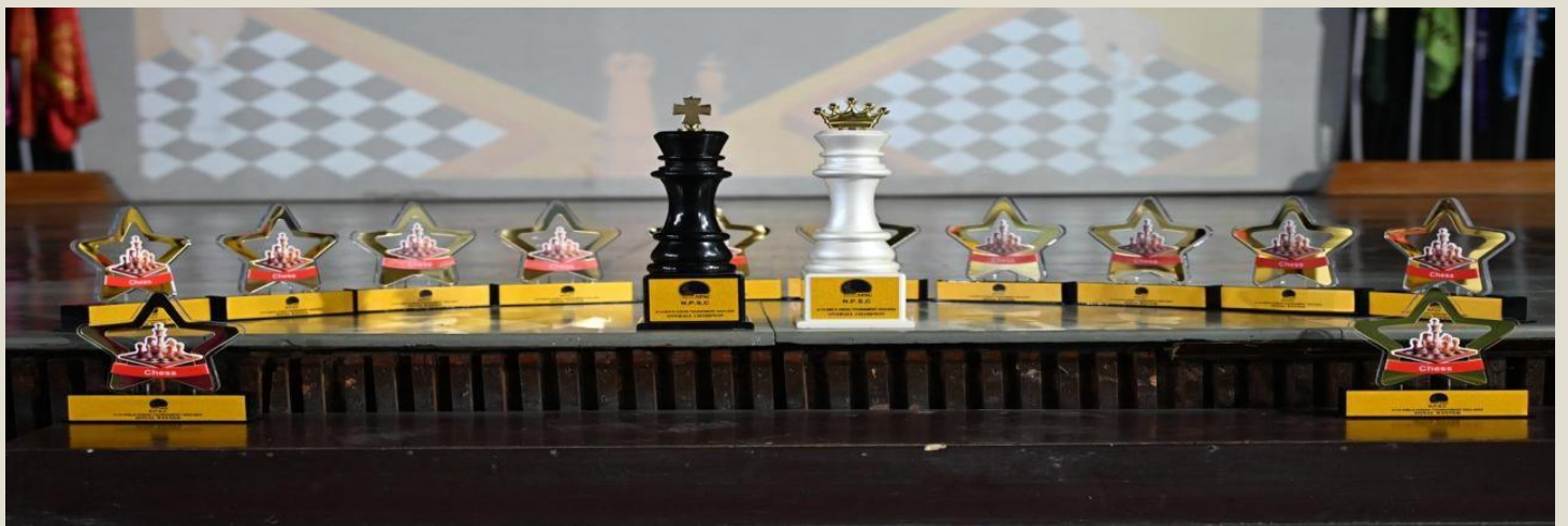
Magnificent Masterpieces for Young Grandmasters