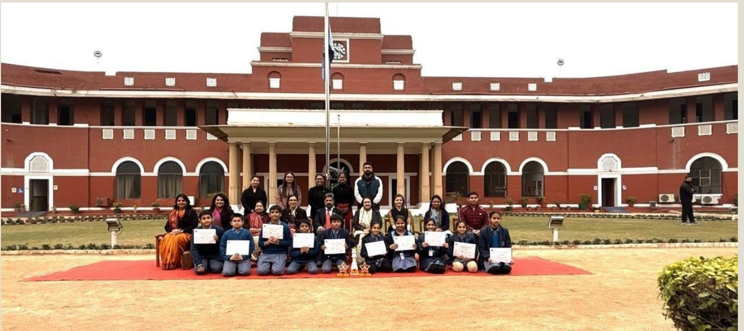
Winners of NPSC U14 Chess Tournament

The final leg of the tournament was inaugurated with an opening ceremony, setting the stage for a contest that not only celebrated intellect and strategy but also underscored the values of discipline, resilience, and camaraderie among young minds.