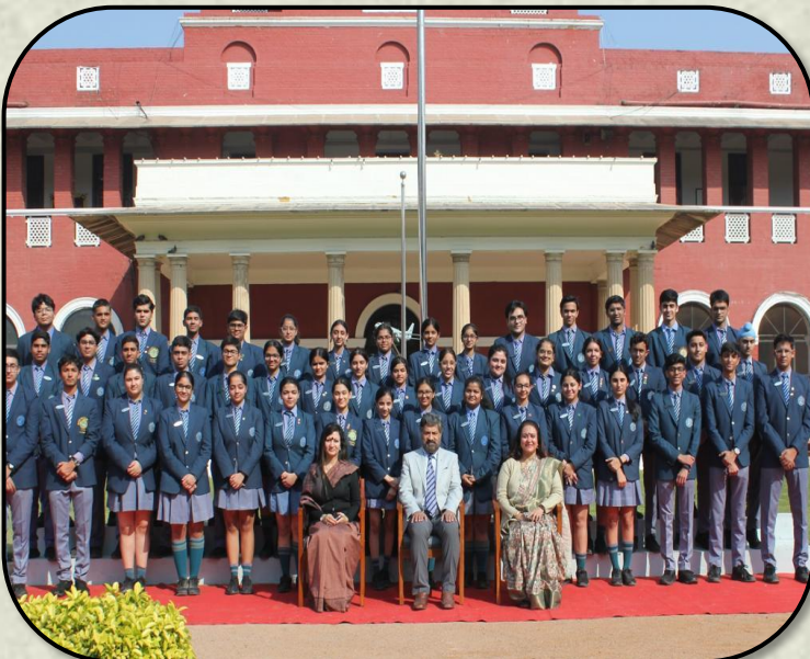
The Principal with the Newly Appointed House Captains and Vice Captains