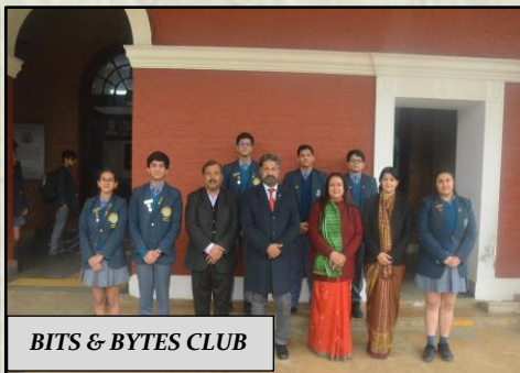
BITS & BYTES CLUB