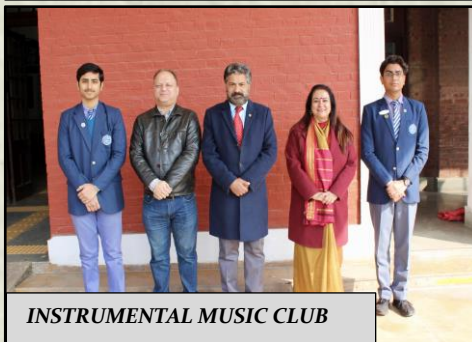
INSTRUMENTAL MUSIC CLUB