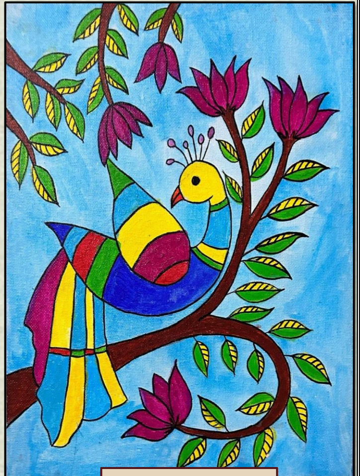
GAURI CHAURASIA, 7-H