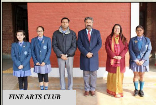
FINE ARTS CLUB

Modern Barakhamba offers a range of clubs and societies that cater to the diverse interests and talents of our students. The club positions in our school provide students with valuable opportunities to develop essential skills, build relationships, and contribute to the school community. By embracing these leadership opportunities, our students will continue to excel, grow, and make a lasting impact on our school community.