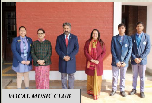
VOCAL MUSIC CLUB