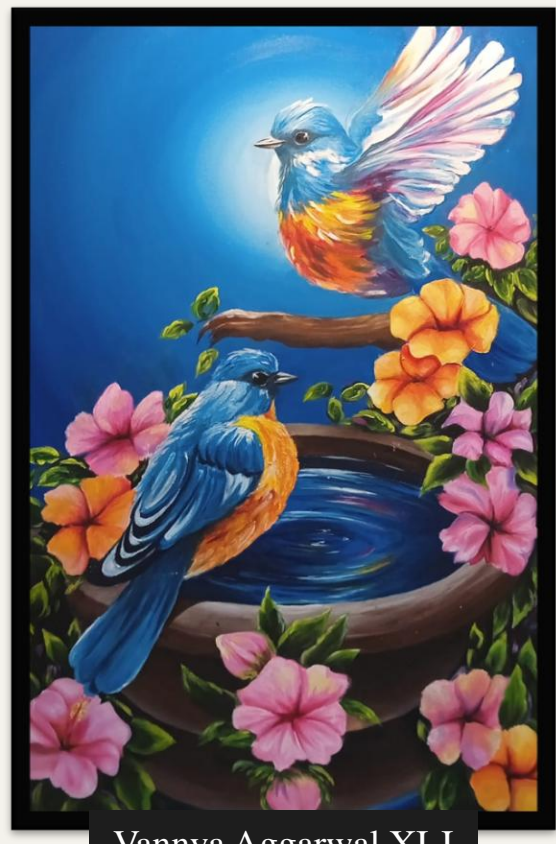
Vannya Aggarwal XI-I