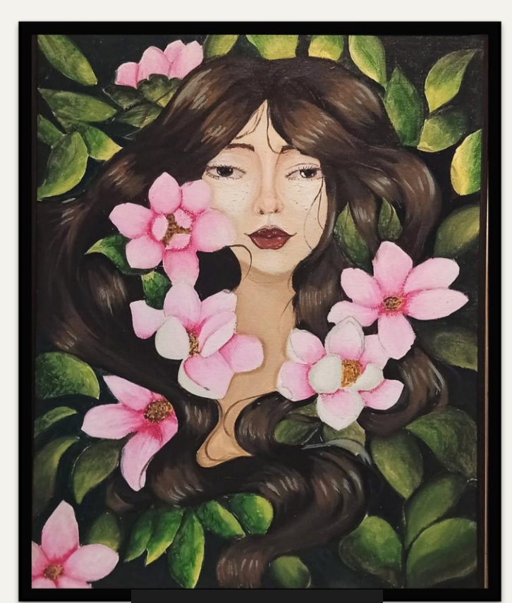
Sakshi Ramesh XII-I