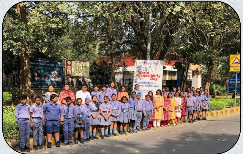
A purposeful stride in learning, with mentors by their side

The students started from Gate 5 and walked on Todarmal Lane, ensuring that they stayed on the designated pedestrian pathway. Upon reaching the Mandi House Circle, the students made sure to cross within the marked zebra crossing