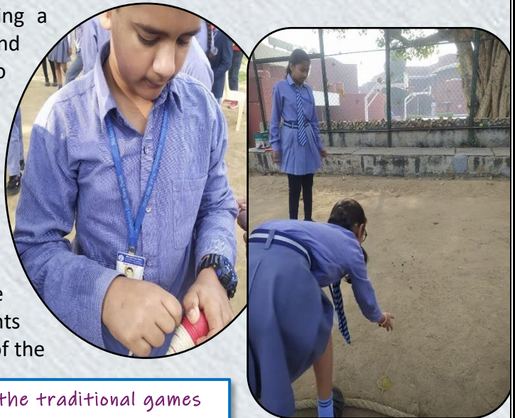
Students actively participating in the traditional games

Modern Barakhamba aims at honing the latent skills in the students by creating opportunities in distinguished fields. These activities not only promote a sense of happiness but are also beneficial for children's holistic development. Recognising the importance of maintaining a healthy balance, a series of traditional games and recreational activities were organised from 11 th March to 28 th March, 2025. Students learned and enjoyed games such as kho-kho, kabaddi, marbles, and lattu . Additionally, the morning practice sessions for all sports helped children enhance their fitness and improve their skills in their respective sports. Engaging in sports not only promotes physical fitness but also fosters teamwork, discipline, and resilience among students. Moreover, recreational activities such as art, music, and drama provide avenues for self-expression and creativity, allowing students to explore and develop their talents beyond the confines of the classroom.