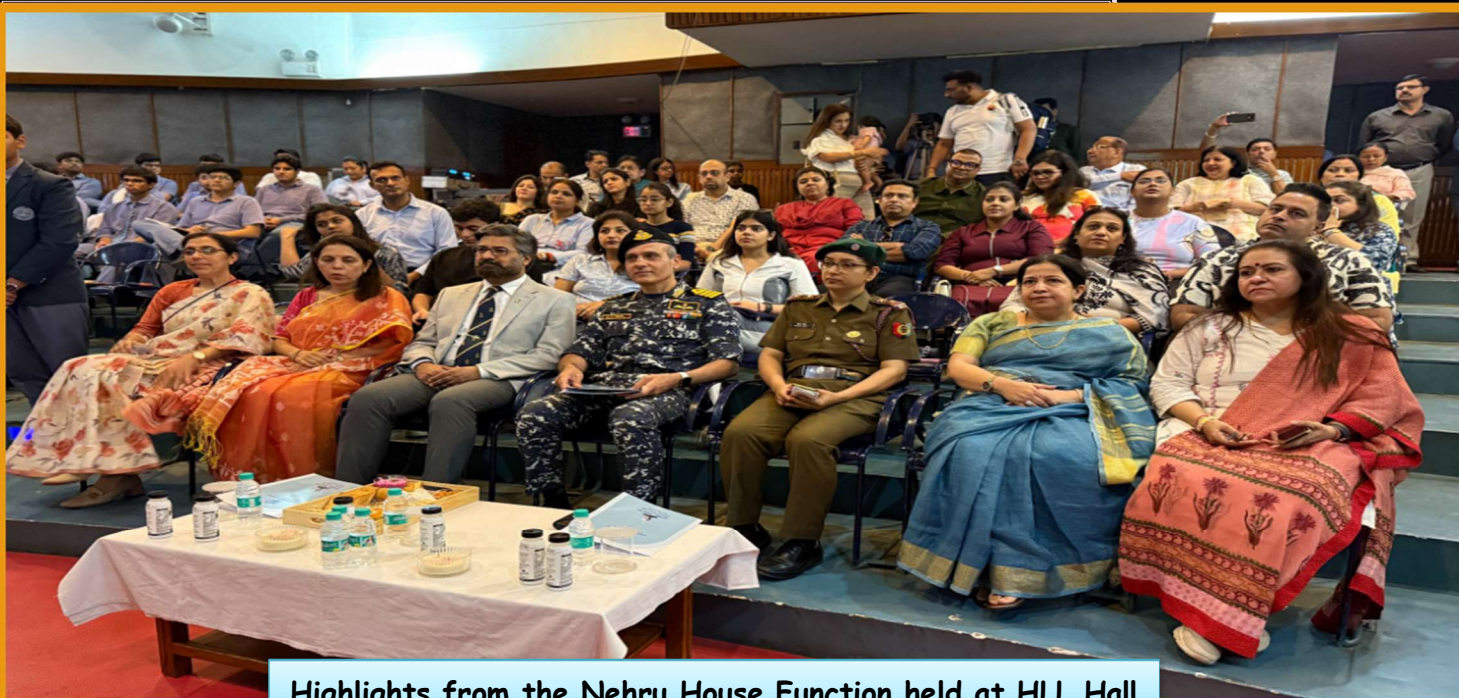
Highlights from the Nehru House Function held at HLL Hall