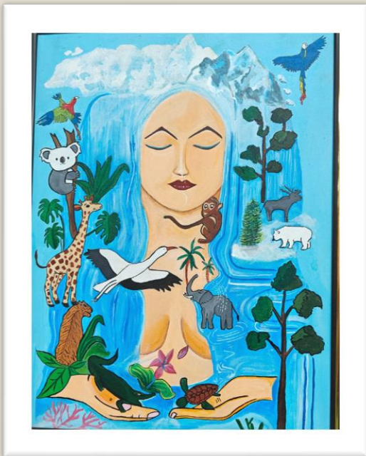
Name of the student - Siyona Kumar Class & Section - 9 - B