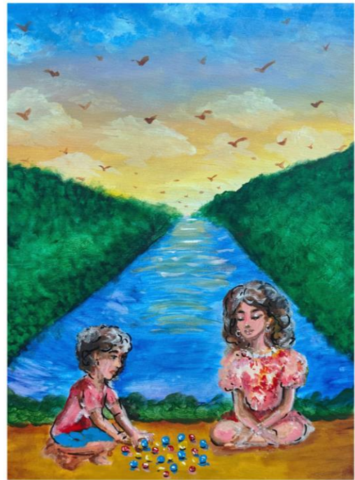
Name of the student - Aradhana Singh Class & Section - 7 - G