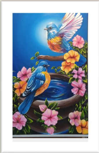
Name of the student - Vannyya Aggarwal Class & Section - 11 - B